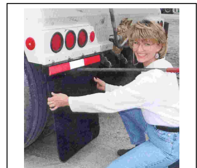
Changing flaps is easy. Anyone can do it!

“Operators who have purchased custom-printed flaps should consider EZ Grip™,” says Adrian, “Because flaps can be reused and drivers can protect their investment in personalized flaps.”